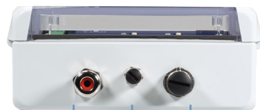
Cable bushing M8 connection M12 connection